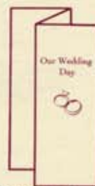
"Z" Fold Program