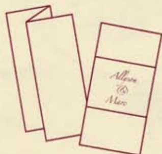
"Z" Fold Program w/ Wrap