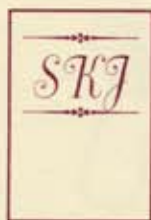
Basic Fold Program

The following wedding program examples feature different program styles and wording options. Refer to them for inspiration when creating your own wedding programs.