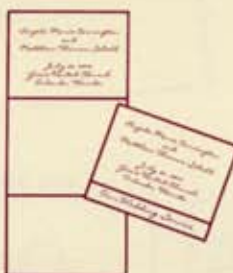
Vertical "Z" Fold Program